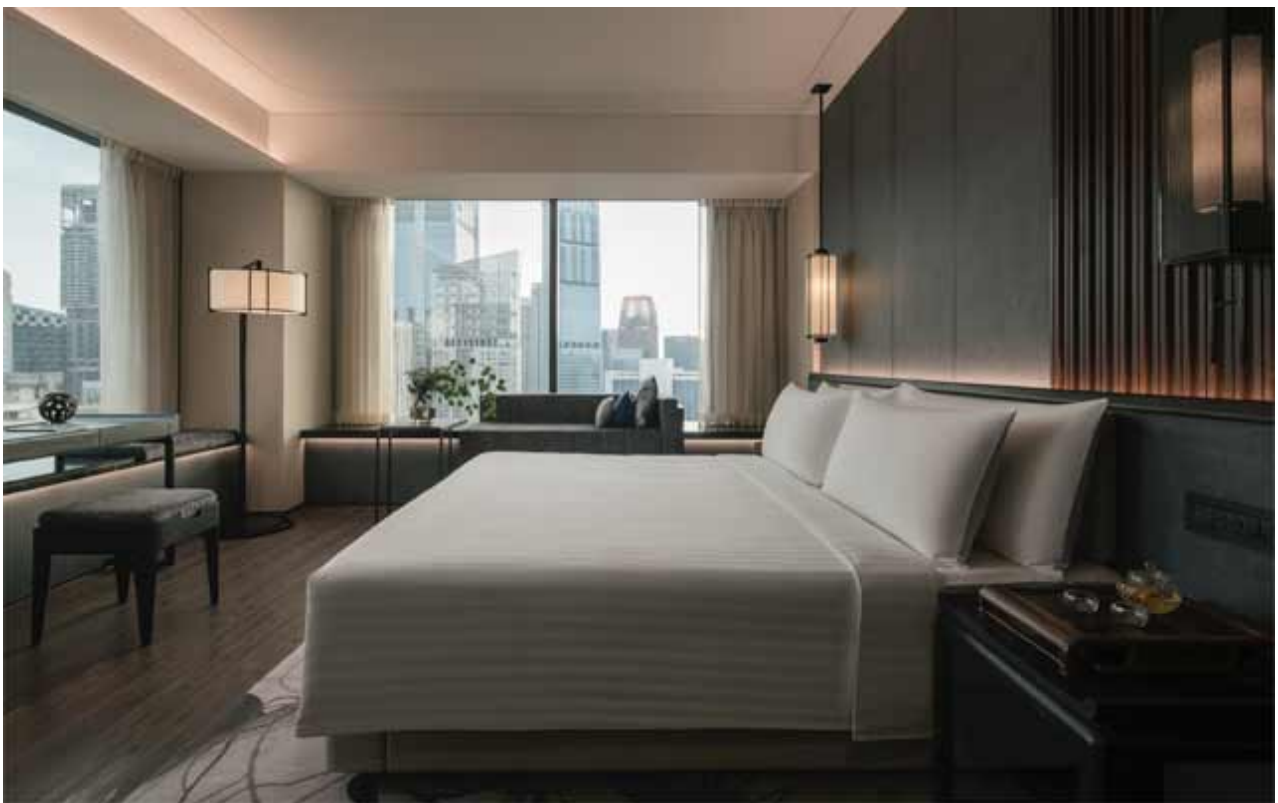
Grand Premium Room under the Masters Series Rooms