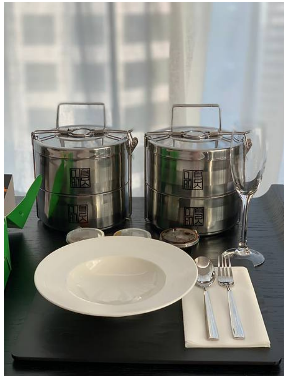
The dishes are delivered to your room in sleek stainless steel tiffin carriers.

The dishes are ordered directly from these renowned hawkers located all around the island and delivered to your room in sleek stainless steel tiffin carriers. (Props for using ecoconscious containers!)