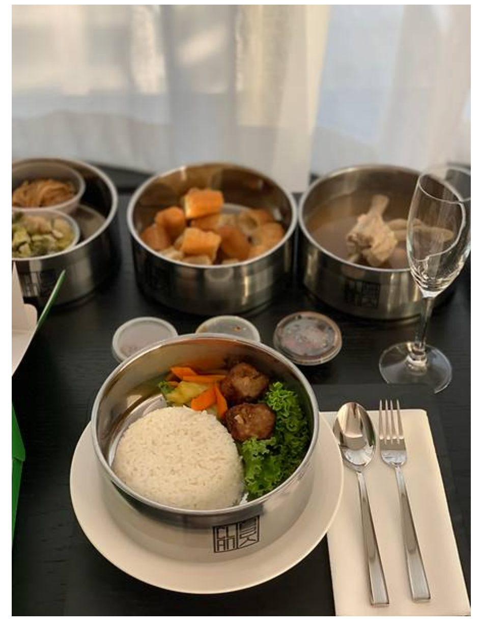
Legendary Bak Kut Teh.