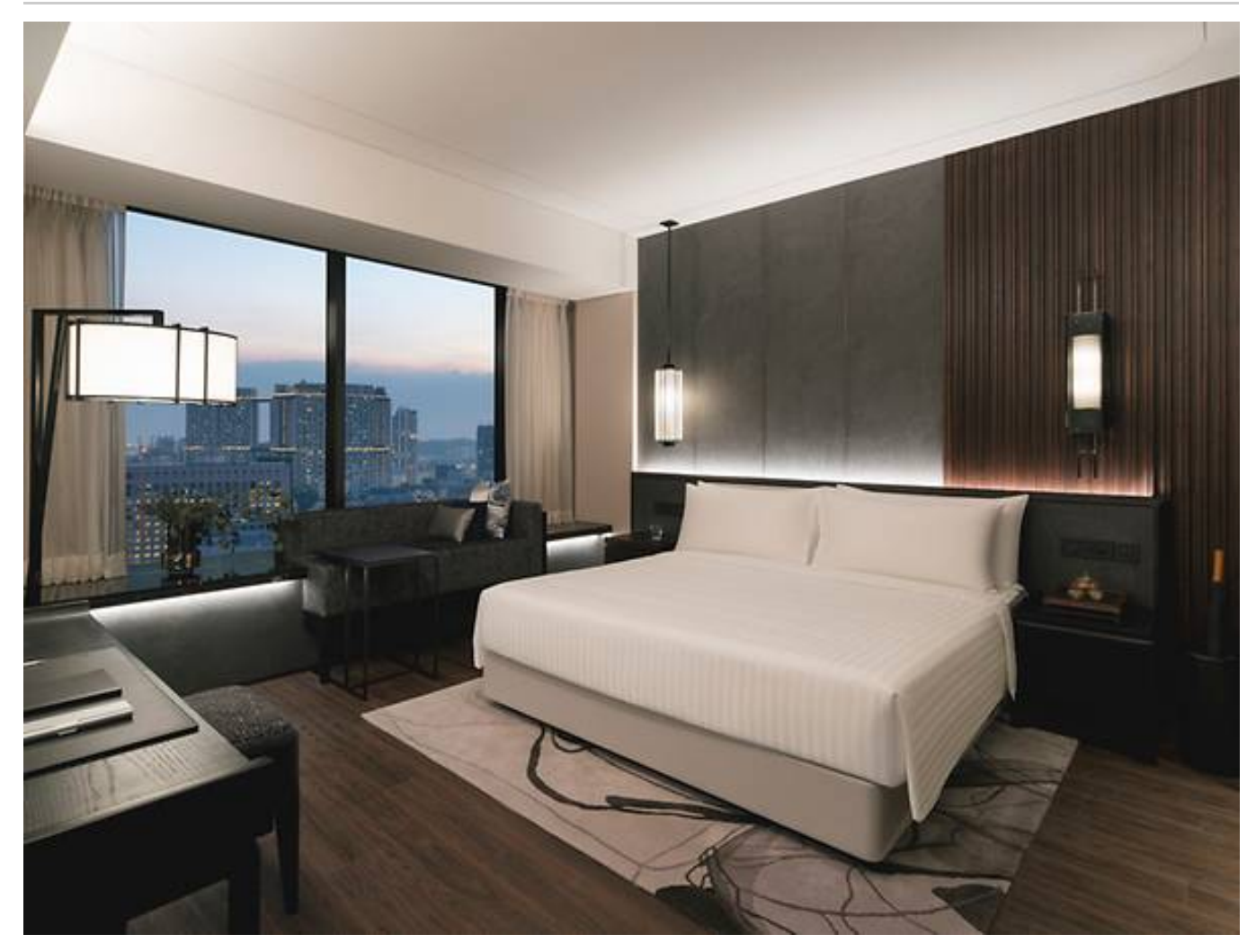
A Grand Premier Room overlooking Pinnacle@Duxton.