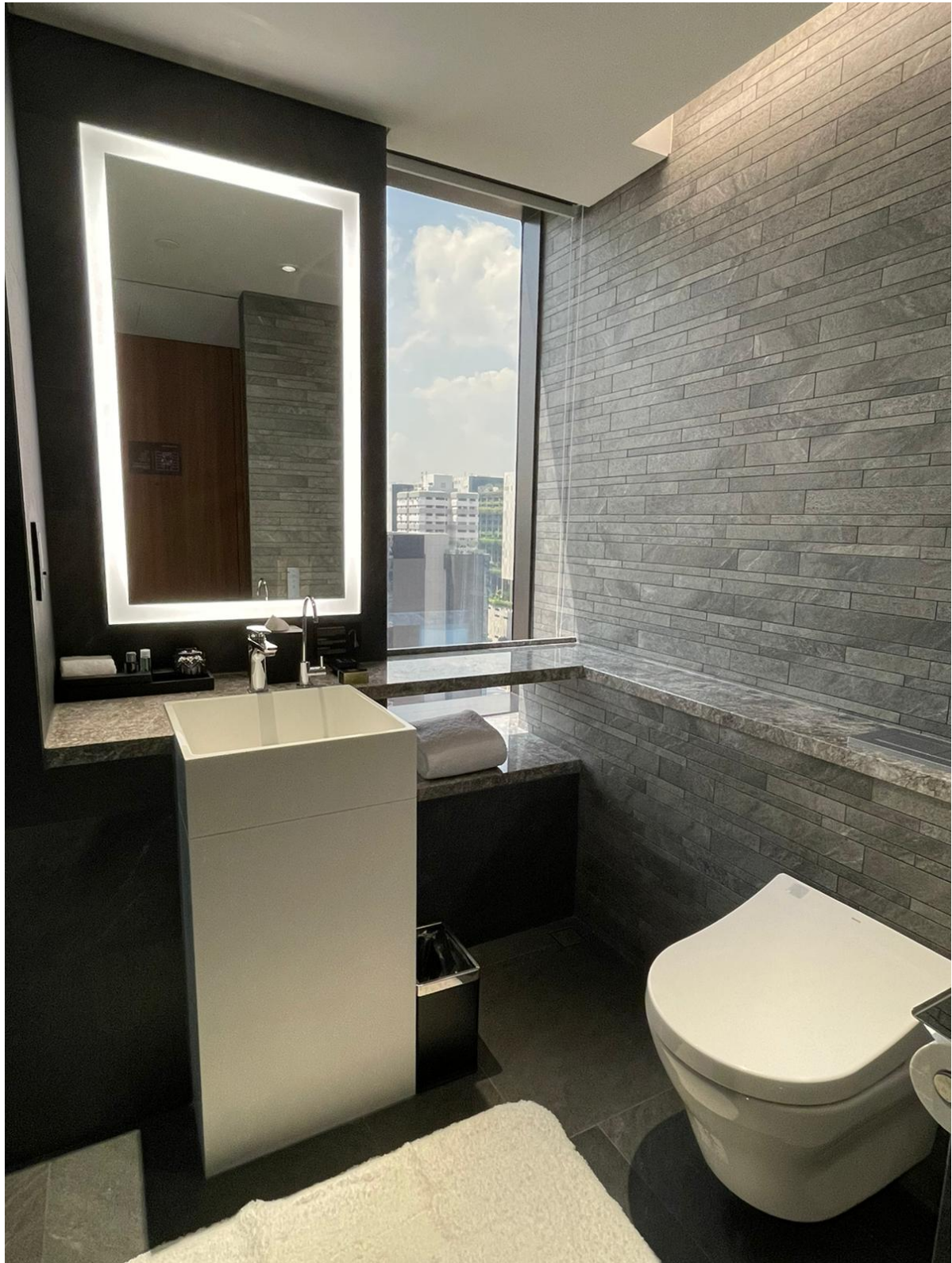
Bathroom with a view

There's also a Hyflux filtered water tap in the washroom, an eco-friendly alternative to bottled water. Standard tea and coffee making facilities are available, so you can Nespresso anytime of the day. There's also a UV steriliser perched on the desk, so you can easily sanitise your phone or other knick-knacks, a stark but practical reminder that we're still in the midst of a pandemic.