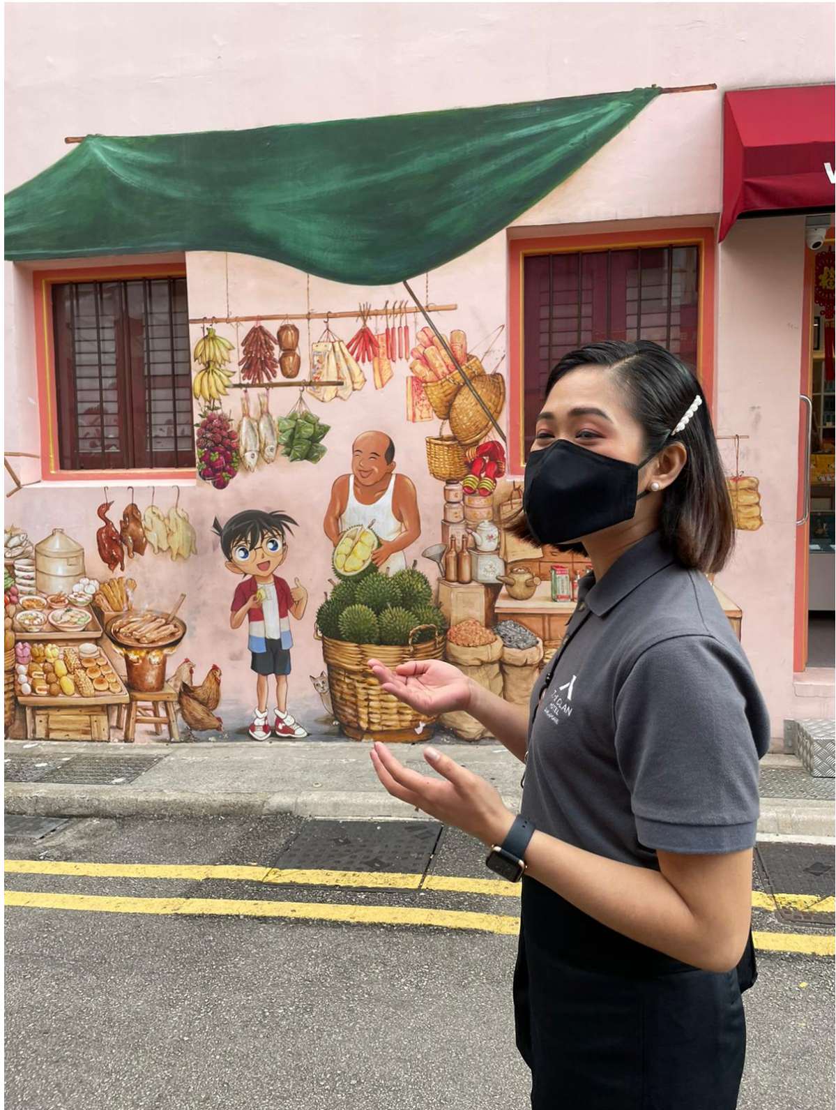
Our amiable tour guide takes us through a jaunt around Amoy Street, Pickering Street and Chinatown.

Even though I go on the precinct tour (available for Master Series guests on Wednesdays and Fridays; pre-booking required) purely in the name of work, I'm genuinely surprised that for a few fleeting moments, I feel like a tourist exploring a new town. During the two-hour tour, our guide regales us with tales like how a