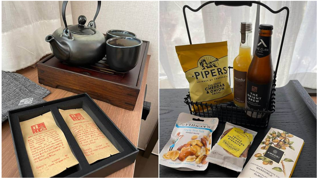
More welcome refreshments in the room.

Guests in the Master Series category also get to choose up to five items for a complimentary basket of in-room refreshments. We opt for a variety of cheddar and onion crisps, chocolate biscuits and dark chocolates. Of course, we couldn't pass on The Clan Beer Orient Brew, an easy-to-drink craft beer specially created by the homegrown 1925 Brewing Co for the hotel. Master Series guests will also find a surprise at turndown service — a nighttime tea and a lavender essential oil roll-on for a good night's sleep.