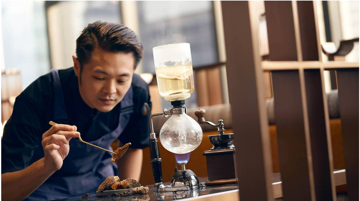
Siphon Mushroom Tea

broth of seasonal mushrooms that's served with a free-range egg custard that is prepared tableside, as well as Short Rib ($68++), grilled over binchotan for an intoxicating smoky flavour and is accompanied by a spicy peanut espuma and sambal matah.