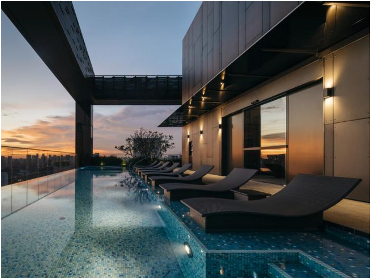
The Sky Pool of The Clan Hotel in Singapore is 30 floors up and has incredible views.

It's a really nice touch, and helped us learn about the origins of Singapore (and where to find the best char kway teow!)