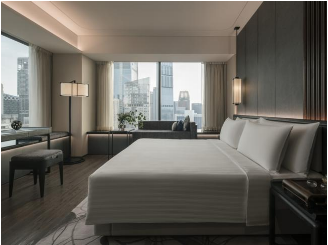
The Clan's Gran Premier Room

The plan is to spend eight days in this city, to really understand the vibe, and what makes it tick.