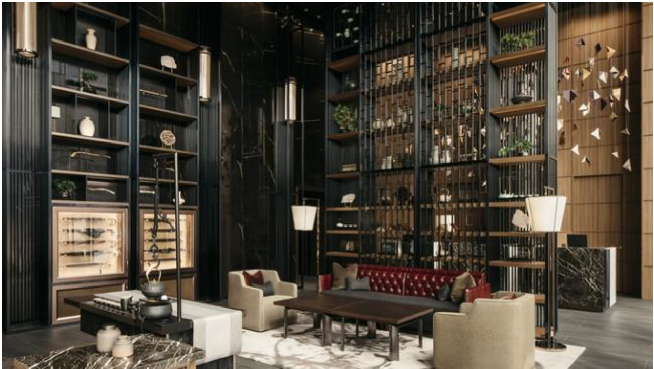
The lobby of The Clan Hotel in Singapore is a nod to the area's rich cultural heritage.

The Clan Hotel Singapore offers an immersive cultural experience with its meticulously designed interiors and personalised services.